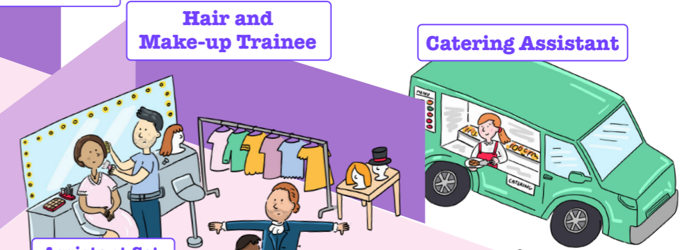
Hair and Make-up Trainee