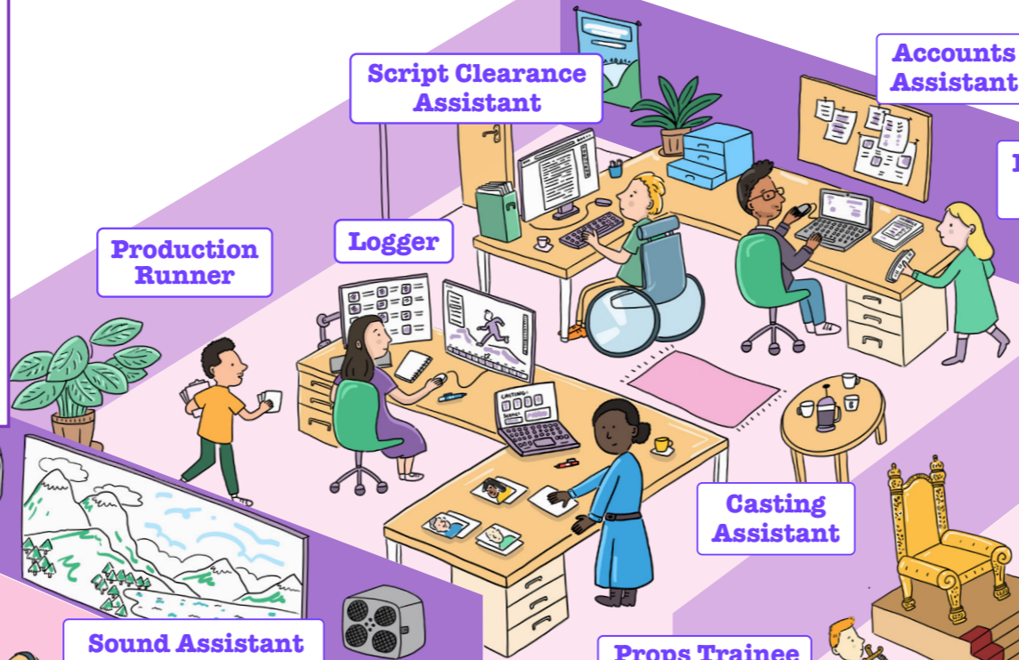
Script Clearance Assistant